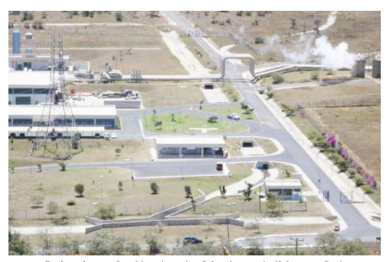
Geothermal energy: One of the projects to benefit from the proceeds of Infrastructure Bond.

In February 2009, the government through the CBK launched the first ever Infrastructure bond (IFB) to finance key economic and social infrastructure around the country. This bond was very successful attracting 145% subscription which was a reflection of huge market buy-in and sense of patriotism by the citizenry in ownership of the country's development agenda.