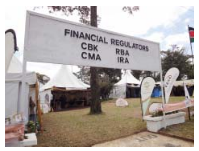
A glimpse of the financial regulators 'village' during the joint participation at the Nairobi International Trade Fair.

The MOU formed the basis of strengthening the financial sector regulators' collaboration in the cross-sector supervision of financial institutions and cooperation in other matters of mutual interest. Currently, plans are underway for SASRA to be a signatory to the MOU.