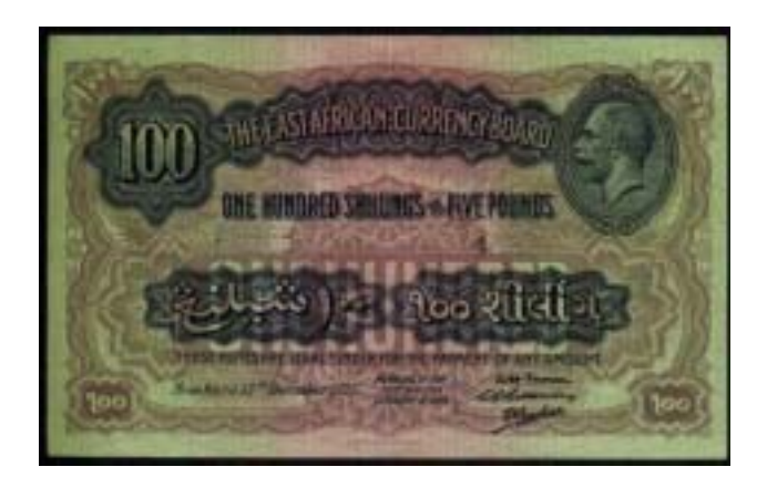
1921 EACB 100 Shilling Note

Kenya began printing and minting its own currency in 1966 under the mandate given to the Central Bank of Kenya that was established in the same year.