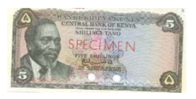
First Kenyan banknotes

The initial issue of Kenya shilling notes were in the denominations of 5, 10, 20, 50 and 100 shillings, all bearing the portrait of the First President of Kenya, H.E. Mzee Jomo Kenyatta in the front, and diverse scenes of economic activities in Kenya at the back.