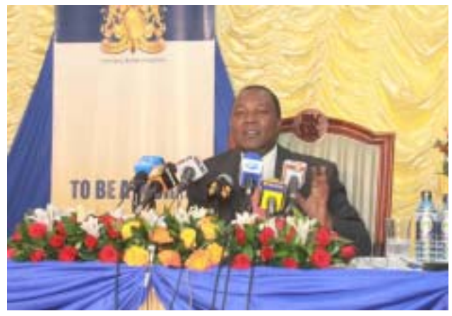
Governor adressing press after the Monetary Policy Committee meeting in January 2011

At a secondary level, the health of the Kenyan currency internationally, as depicted by strengthening or weakening of the Kenya Shilling against the US dollar, was also of interest and hence expectations in this area were also elicited.