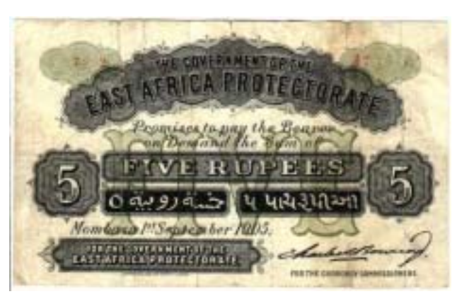
1905 Five Rupees

Despite the Thaler's popularity in the East African Coast, it was not able to penetrate upcountry and the Indian Rupee was used for payment of Indian workers during the building of the Kenya-Uganda railway in 1896 and managed to move inwards becoming acceptable by the African population who in various mother tongues called it different names such as "Rupia" or "Pesa".