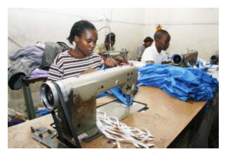
Women sew clothes at a local industry funded by SMEs through loans

It is worth noting that microfinance was an initial effort to reduce poverty by improving access to finance for the poor. Microfinance Institutions (MFIs) usually extend small loans to the poor who have no collateral or credit history and cannot borrow from mainstream financial institutions. However, microfinance alone cannot