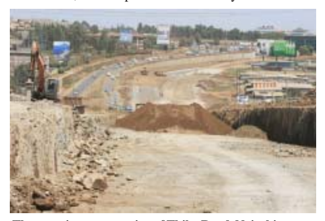
The on-going construction of Thika Road, Nairobi, funded by proceeds from the infrastructure bond.

To begin with, lengthening of the maturity of securities in the domestic debt portfolio was the initial task to be accomplished. Prior to 2002, government domestic debt component of public debt consisted mainly of short term instruments, a source of significant refinancing risk. In fact, the composition of Treasury bills to bonds